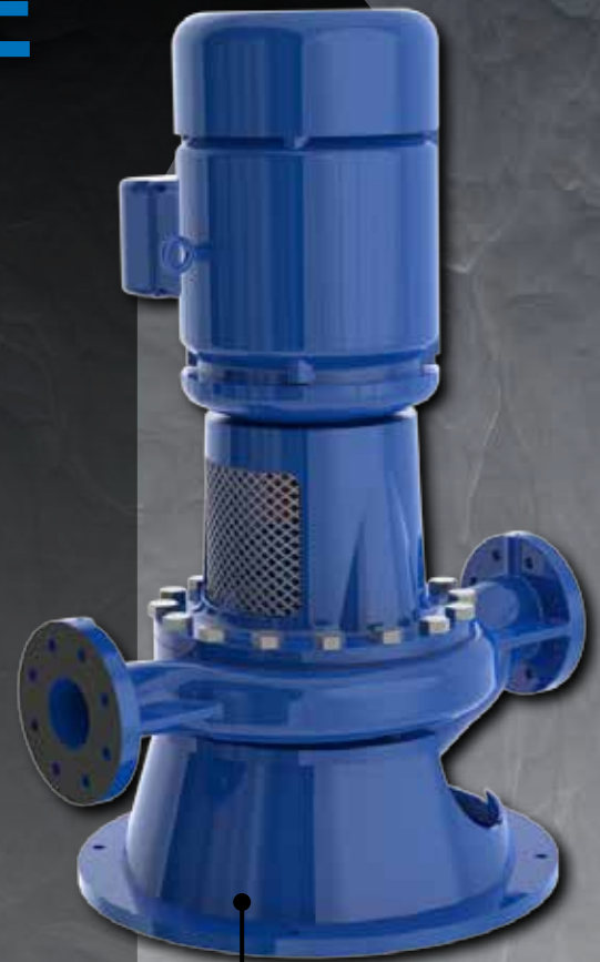
VLS PUMP [Shown with optional CI stand]

For consulting engineers, visit GrundfosExpress.com for technical information. For Grundfos sales and distributors, visit GrundfosExpressSuite.com