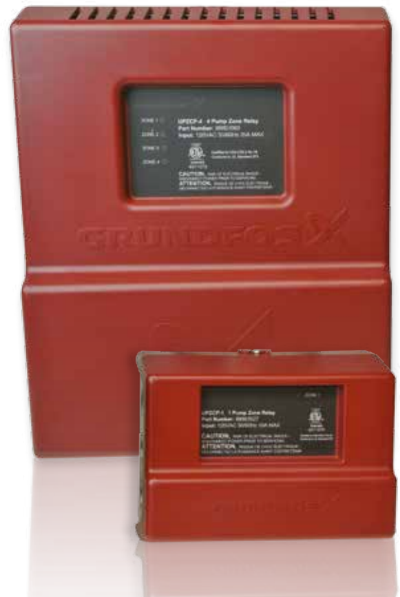
Zone control display as seen above.