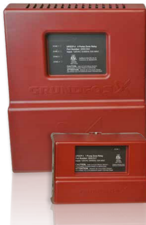
Zone control display as seen above.