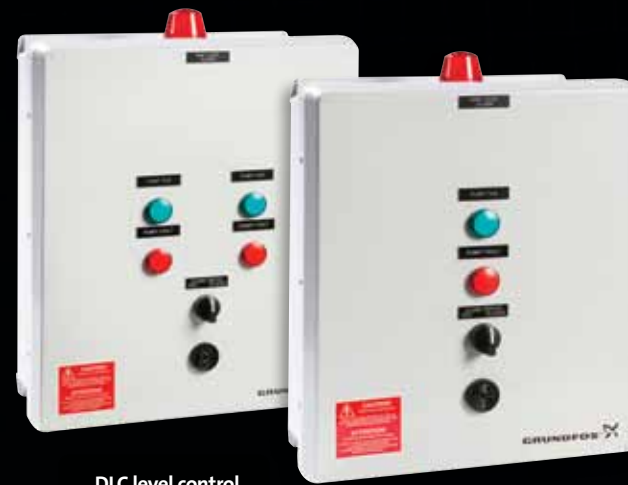
DLC level control